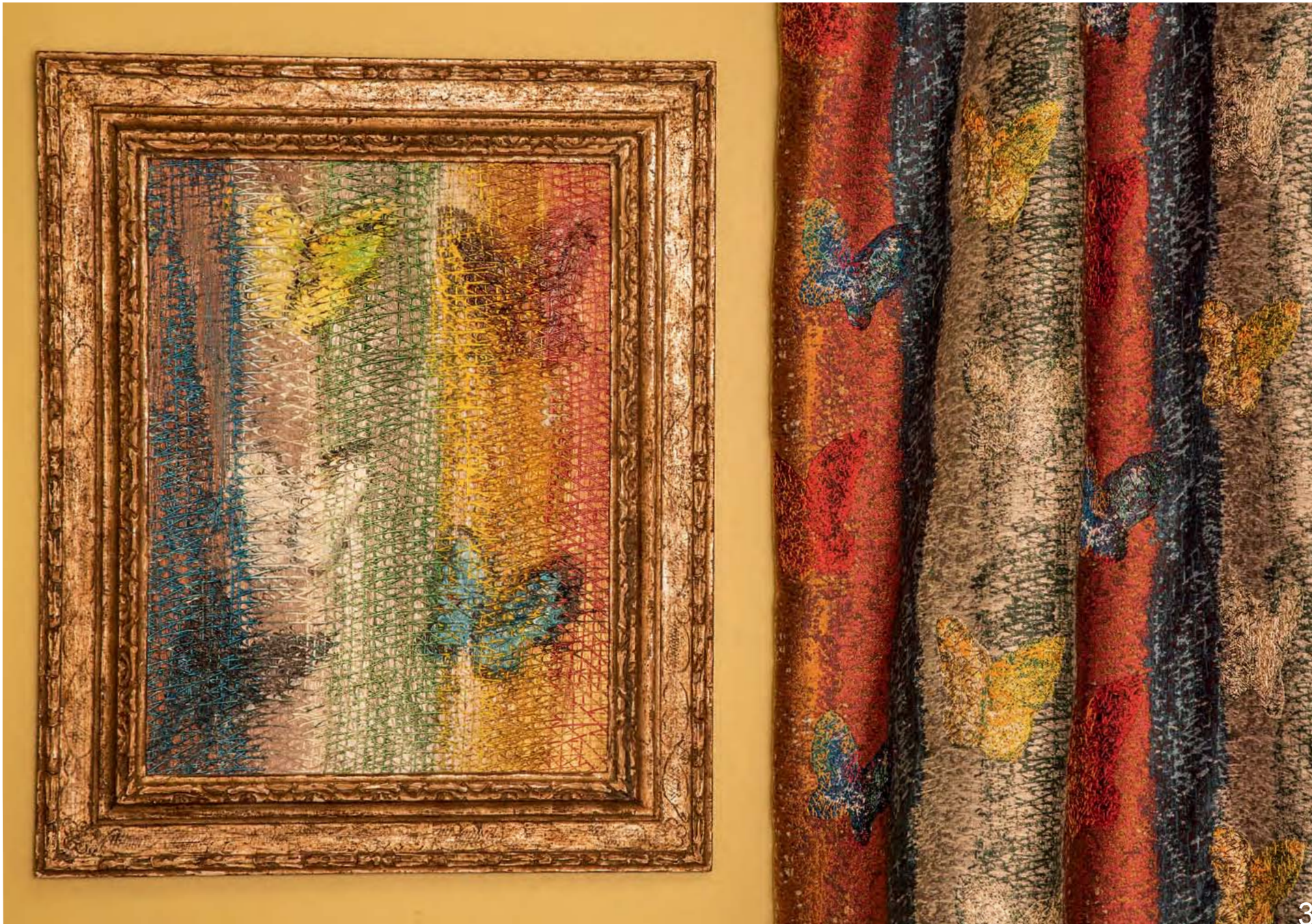
Fritillery, Multi GWF-3402.953