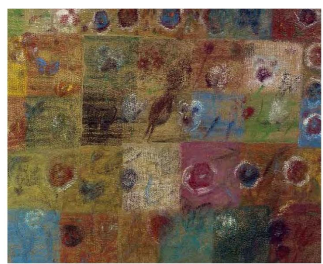
Blue Hairstreak, 1998, Oil on canvas 72" x 84"