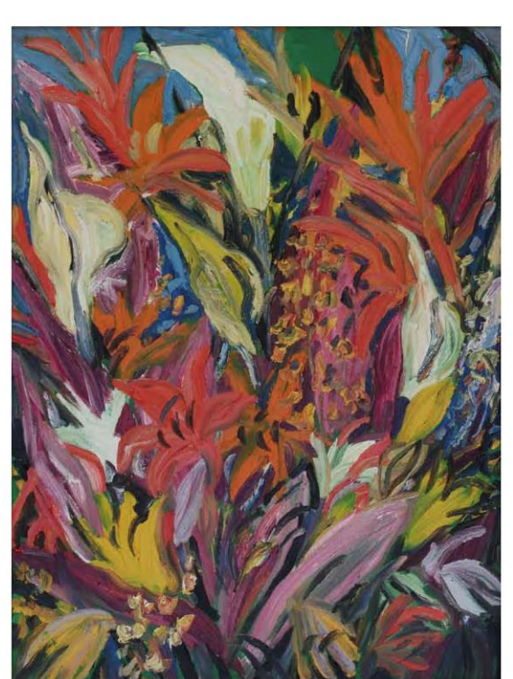
October 14th, Callas, 2003, Oil on canvas 40" x 30"

Collection Arrives at Customs House, Clarksville, Tennessee