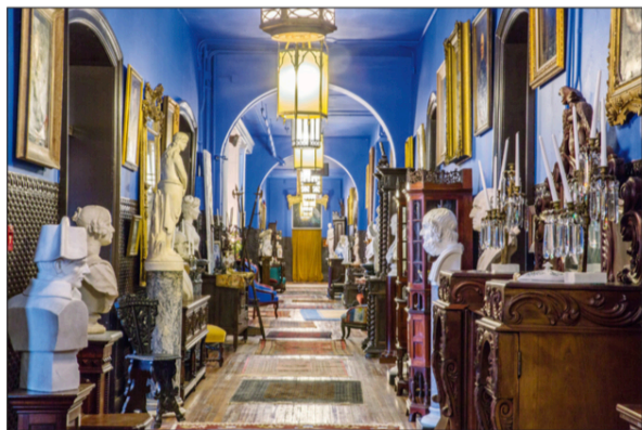
Interior of Colonel Louis Watres Armory