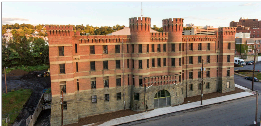
The Colonel Louis Watres Armory, Scranton, Penn.