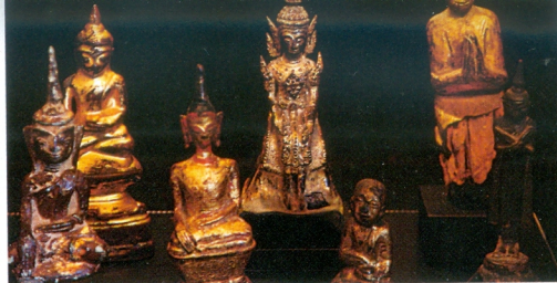
A view of the upstairs sitting room. Right: A collection of Buddhas. Below: Tatiana's "paperless" home office.