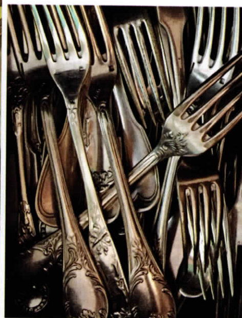
Library Slonem is passionate about color and chose Sherwin-Williams's "Solaria." Silverware Ornate "Marly" design by Christofle. Bedroom A 19th-century copy of Bellini's Portrait of Doge Leonardo Loredan graces the bedroom. Hallway A grouping of Slonem's iconic bunny paintings adorns this wall, but you can get the look with "Bunny Wall," a Lee Jofa wallpaper from its Groundworks collection.