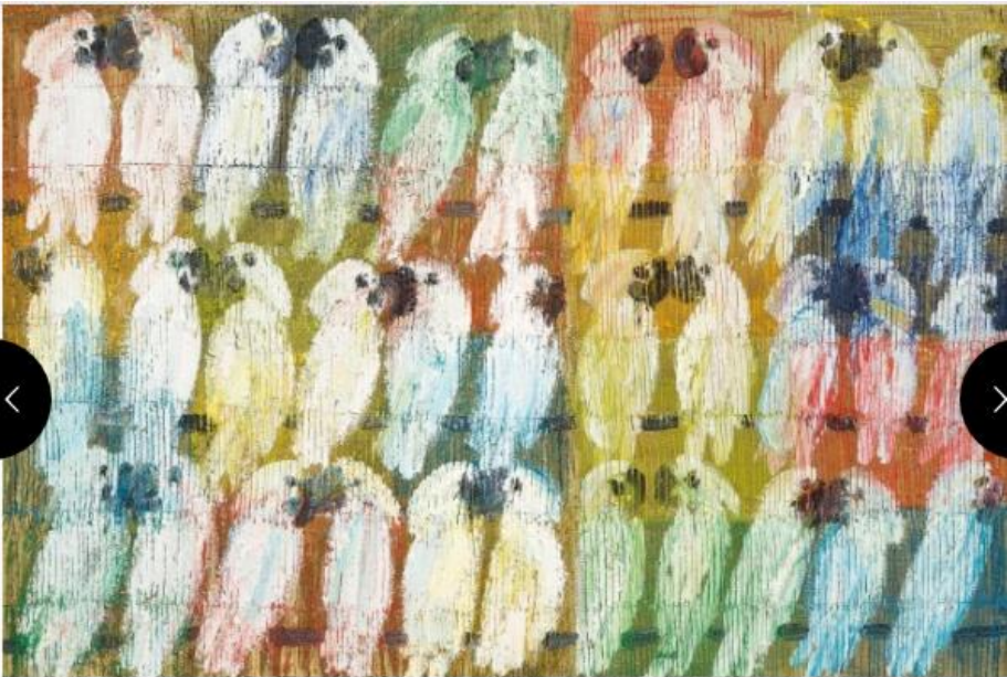
FROM BIRDS BY HUNT SLONEM, :COPYRIGHT: 2017, PUBLISHED BY GLITTERATI INCORPORATED HTTP://WWW.GLITTERATIINCORPORATED.COM