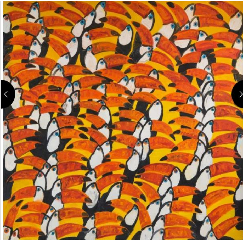
FROM BIRDS BY HUNT SLONEM, :COPYRIGHT: 2017, PUBLISHED BY GLITTERATI INCORPORATED HTTP://WWW.GLITTERATIINCORPORATED.COM

PETS WATCH: Parrot Sings Sia's Chandelier with Perfect Pitch