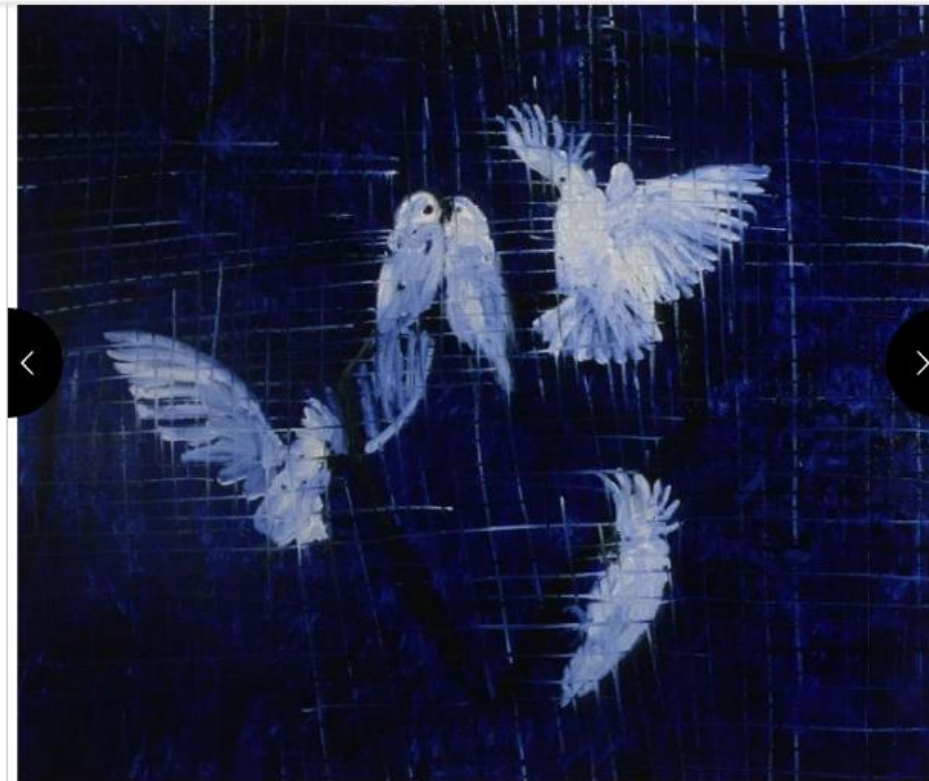
FROM BIRDS BY HUNT SLONEM, :COPYRIGHT: 2017, PUBLISHED BY GLITTERATI INCORPORATED HTTP://WWW.GLITTERATIINCORPORATED.COM

PETS WATCH: This Bird Sings Just Like Rihanna, Could Be Her Backup Singer