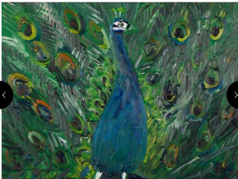
FROM BIRDS BY HUNT SLONEM, :COPYRIGHT: 2017, PUBLISHED BY GLITTERATI INCORPORATED HTTP://WWW.GLITTERATIINCORPORATED.COM

I have a bird named Perky who I'm very fond of, but all birds are highly intelligent. People don't realize how intelligent birds are. They are much smarter than dogs and cats. They are very clear in their wants and they have the intelligence of a 3-year-old human.