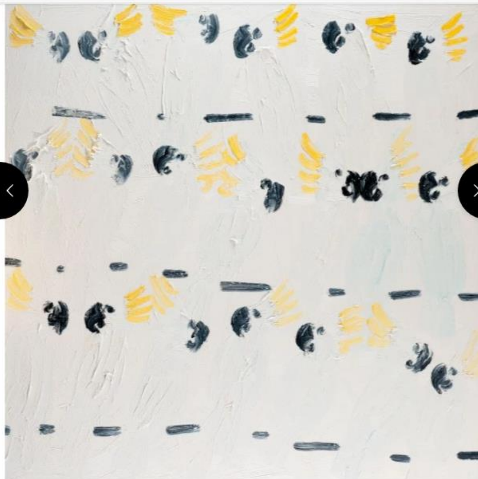
FROM BIRDS BY HUNT SLONEM, :COPYRIGHT: 2017, PUBLISHED BY GLITTERATI INCORPORATED HTTP://WWW.GLITTERATIINCORPORATED.COM

WATCH: Parrot Sings Sia's Chandelier with Perfect Pitch